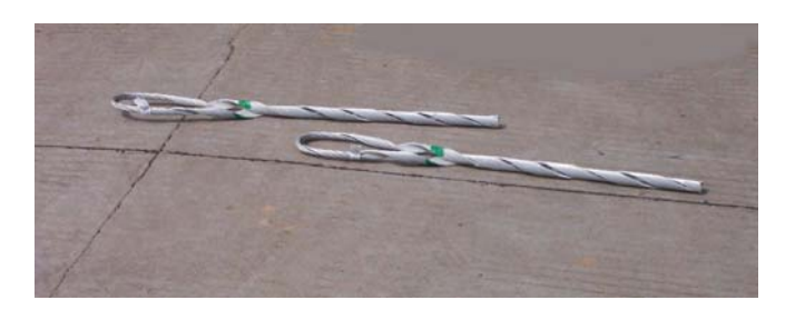
Figure 2 – Frequently used hardware

The designed self-supporting cable must be suspended at the top part of the sewers, where proper hardware and fittings made of stainless steel or other materials after anti-corrosion, anti-rust and passivation treatment should be used to fix the cable. In this way, sufficient life expectancy of the cable can be guaranteed. In addition, the cable closure is also made of materials such as stainless steel, aluminium alloy or engineering plastics, and the closure should be airtight, waterproof and moisture-proof. Figure 2 illustrates the frequently used hardware made of several steel wires which can be stranded tightly around the cable sheath. The inner side of these steel wires is coated with a layer of emery to avoid slip between the cable and the hardware by increasing the friction.