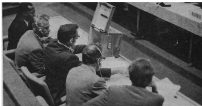
Scrutineers counting the vote