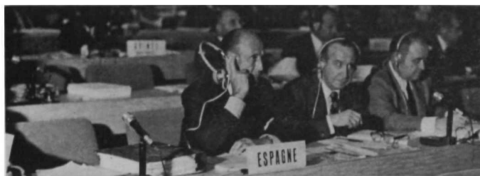
The host government of the Conference, Spain, elected a Member of the Administrative Council: Members of the Spanish delegation