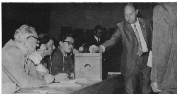
Election of the Members of the Administrative Council: Argentina votes