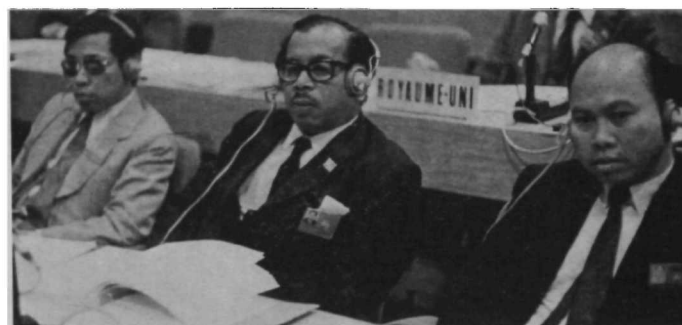
Malaysia, one of the newly elected Members of the Administrative Council