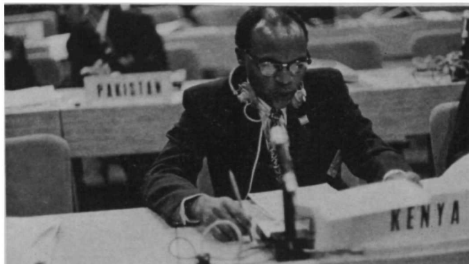
Kenya has invited the ITU to hold its next Plenipotentiary Conference in Nairobi