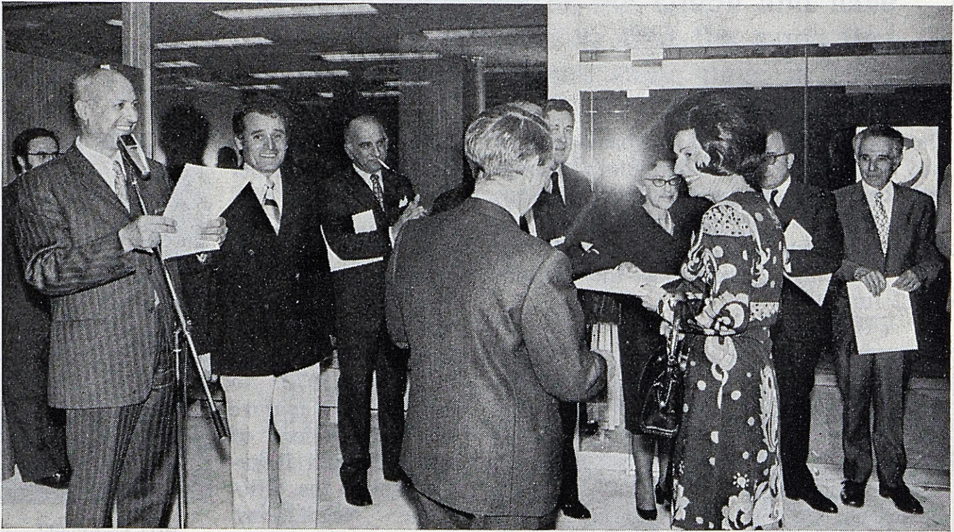
Presentation of the diploma to a charming ITU staff member

At a reception held on 17 May 1973 to celebrate World Telecommunication Day and the official opening of the ITU tower (see the Telecommunication Journal , July 1973, page 349) the Secretary-General of the ITU presented diplomas to 32 staff members to celebrate the 25th anniversary of their entry into the service of the Union and as a tribute to their devoted service.