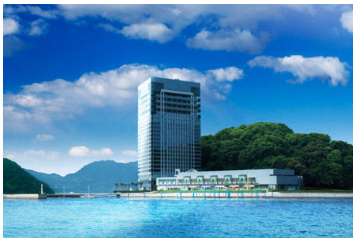
Venue of WTIS 2015 Grand Prince Hotel Hiroshima, Japan