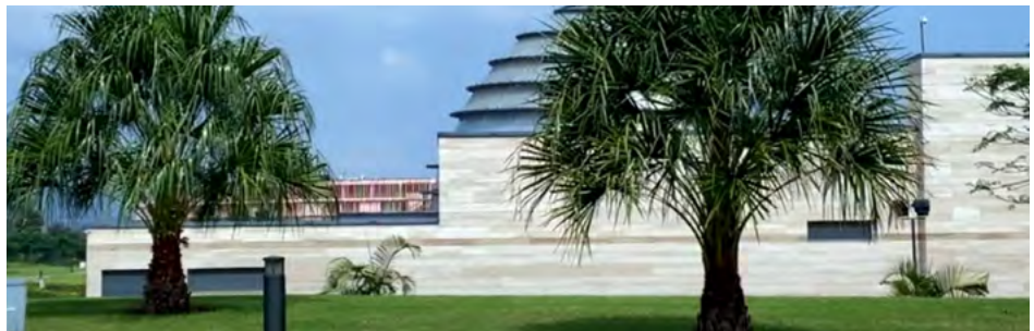
WTDC Highlights video

It has been noted that for many people in rural areas the challenge mostly is not about connectivity – the challenge is about literacy.”