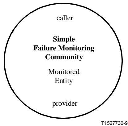
Figure B.1/G.852.1 – ROLE in the Failure Monitoring Community